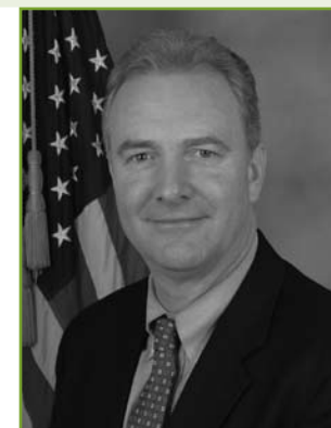
Chris Van Hollen U.S. House of Representatives GUEST SPEAKER & HONORARY CHAIRMAN