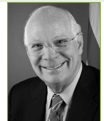
Senator Ben Cardin (D-Md.) HONORARY CHAIRMAN